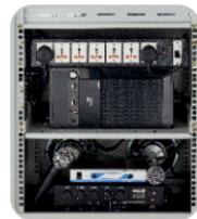
Space for Internal Accessories