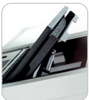
Motorised Screen Tilt Mechanism