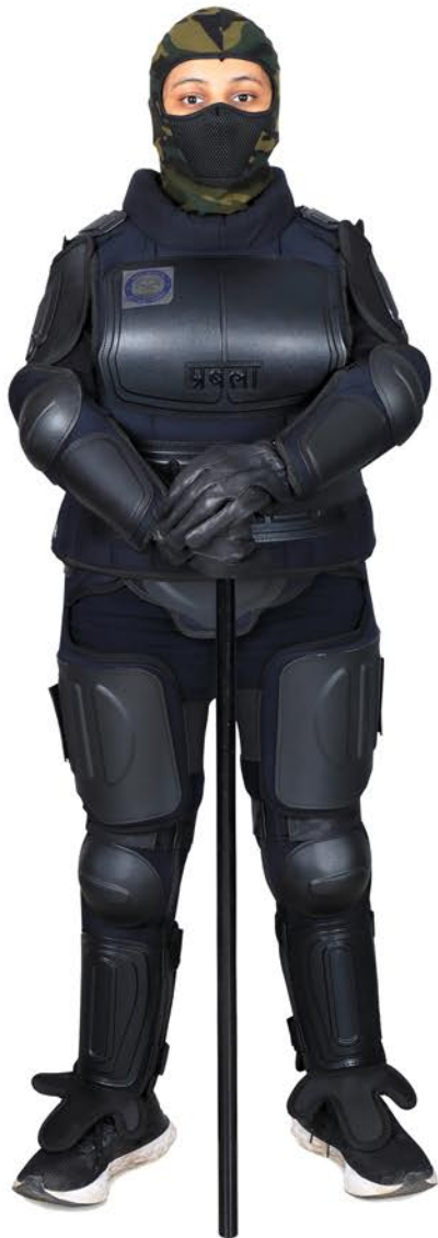
■ Front ■