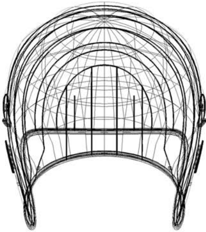
■ Front ■