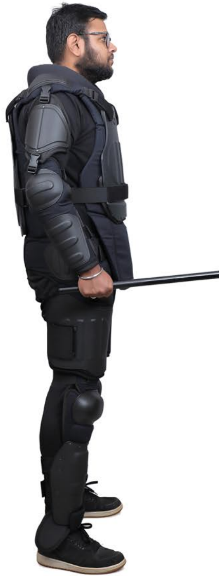
■ Side ■