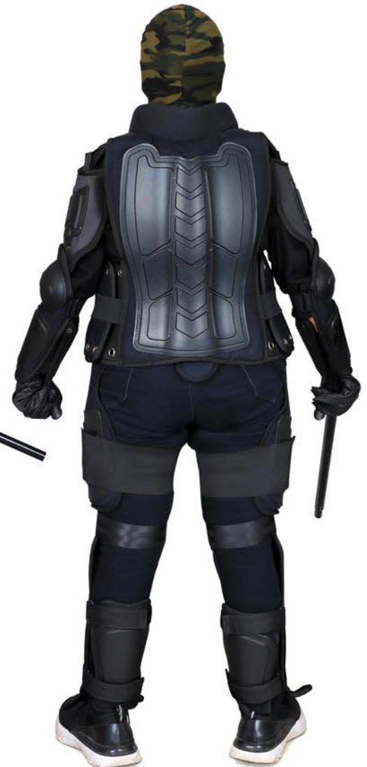
■ Back ■