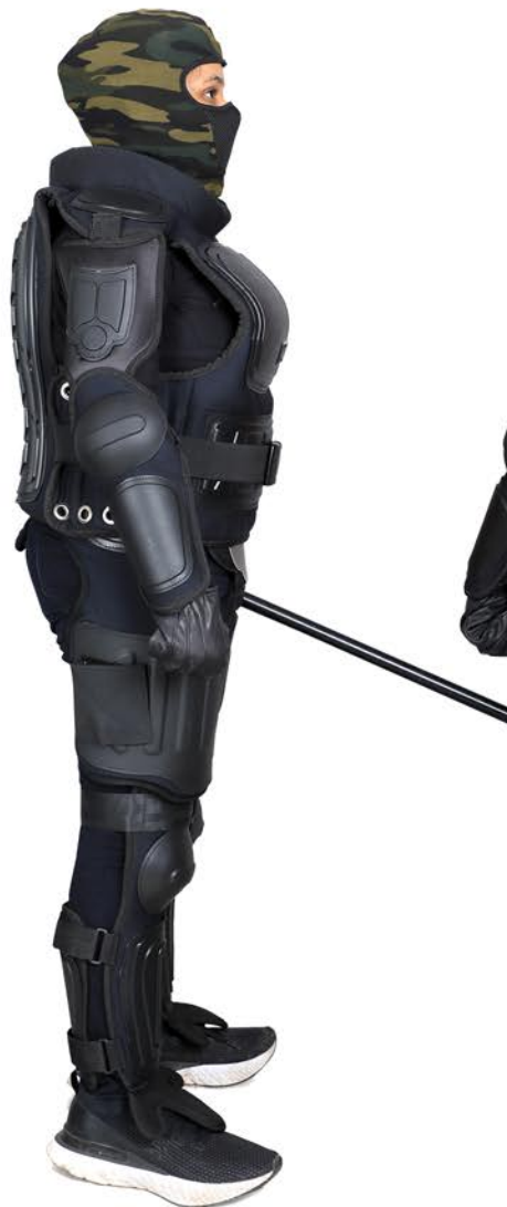
■ Side ■