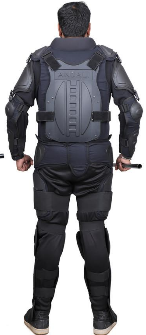
■ Back ■