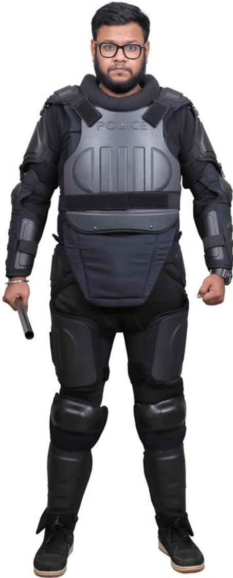
■ Front ■